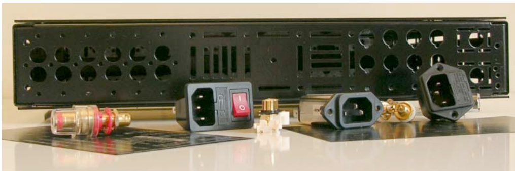
'Blank' ezChassis and accessories available from www.designbuildlisten.com

You can use your ezChassis TM in hundreds of ways. This page shows a few possibilities.