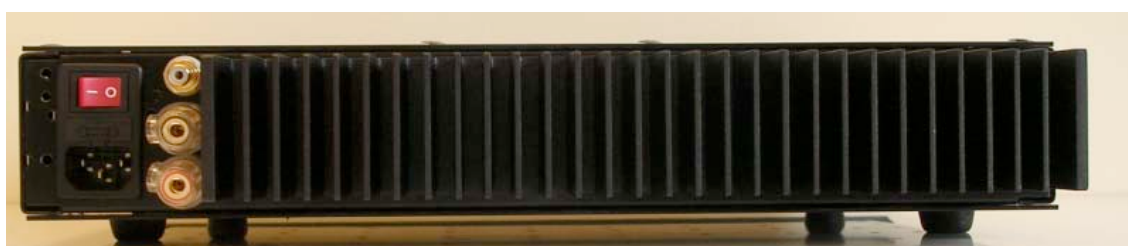
ezChassis as a Mono-Poweramp. 300mm heatsink. Input hole drilled out. IEC mains, fuse & switch.