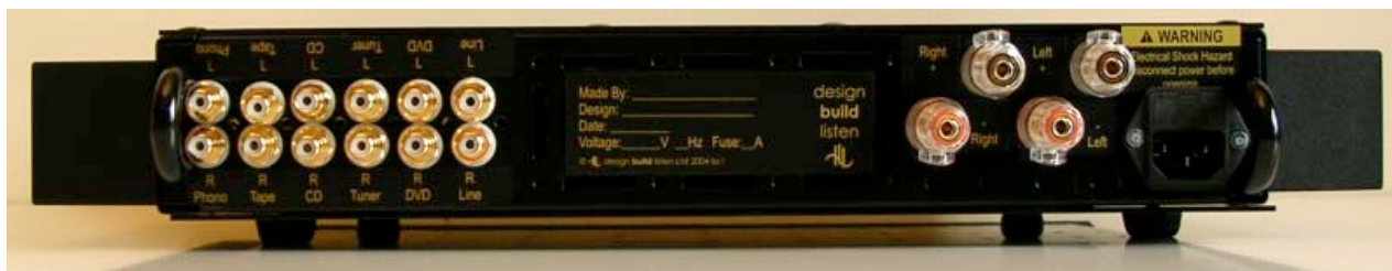
ezChassis as an Integrated Amp, 2x heatsinks. 4x speaker holes covered by labels. IEC mains socket with fuse.