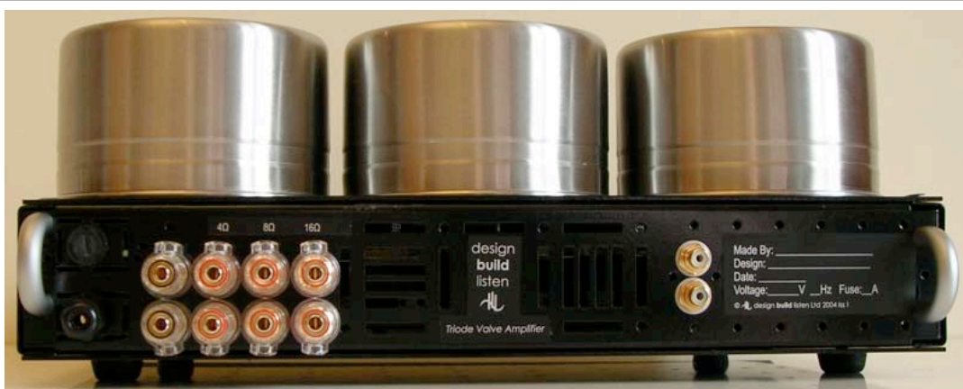
ezChassis as a Valve Poweramp. Input holes blanked by label. Rear handles. fuse & cable